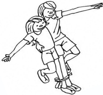
THREE LEGGED RACE