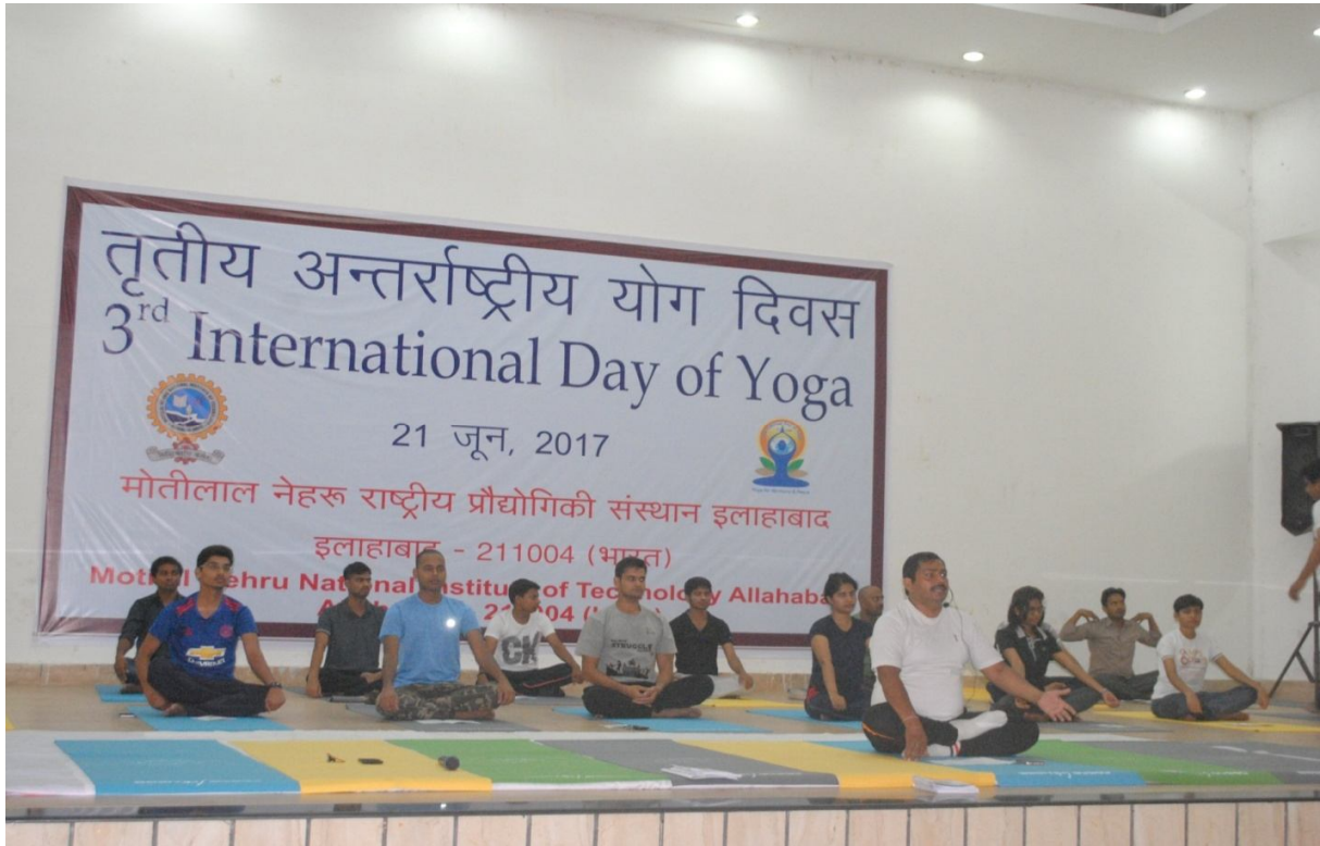
3rd International Day of Yoga