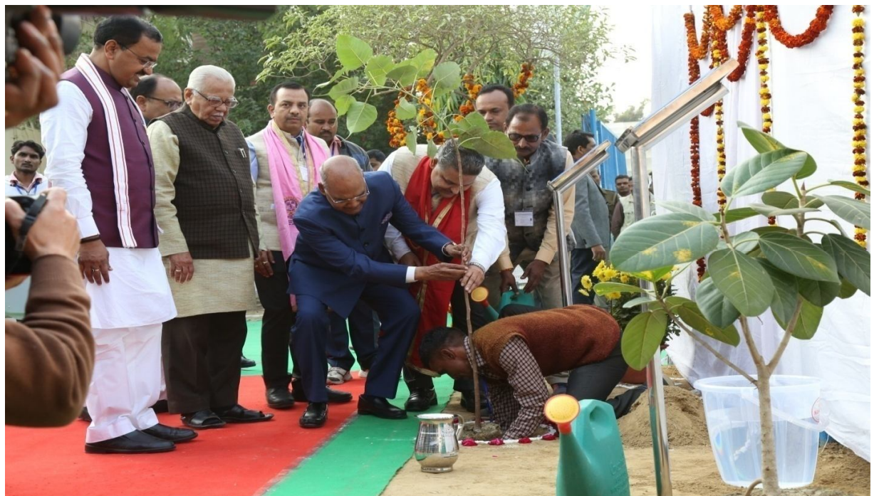
Fourteenth Annual Convocation-2017