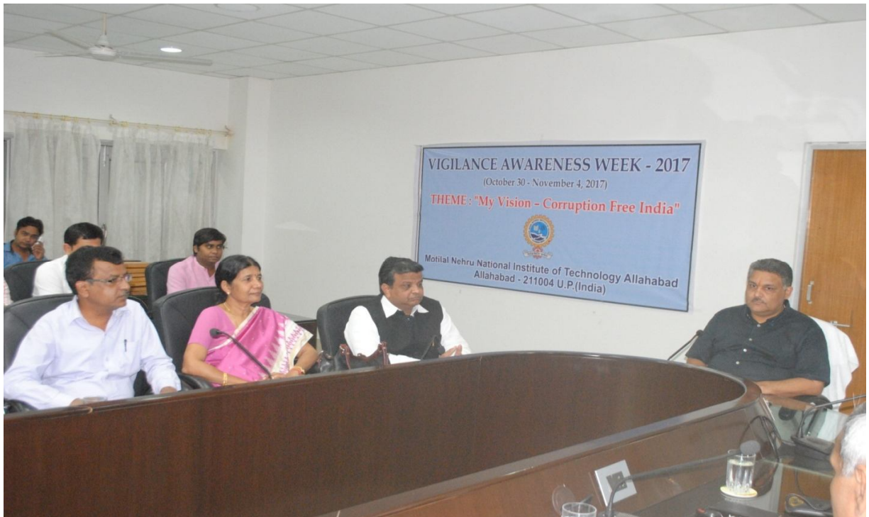
Vigilance Awareness Week