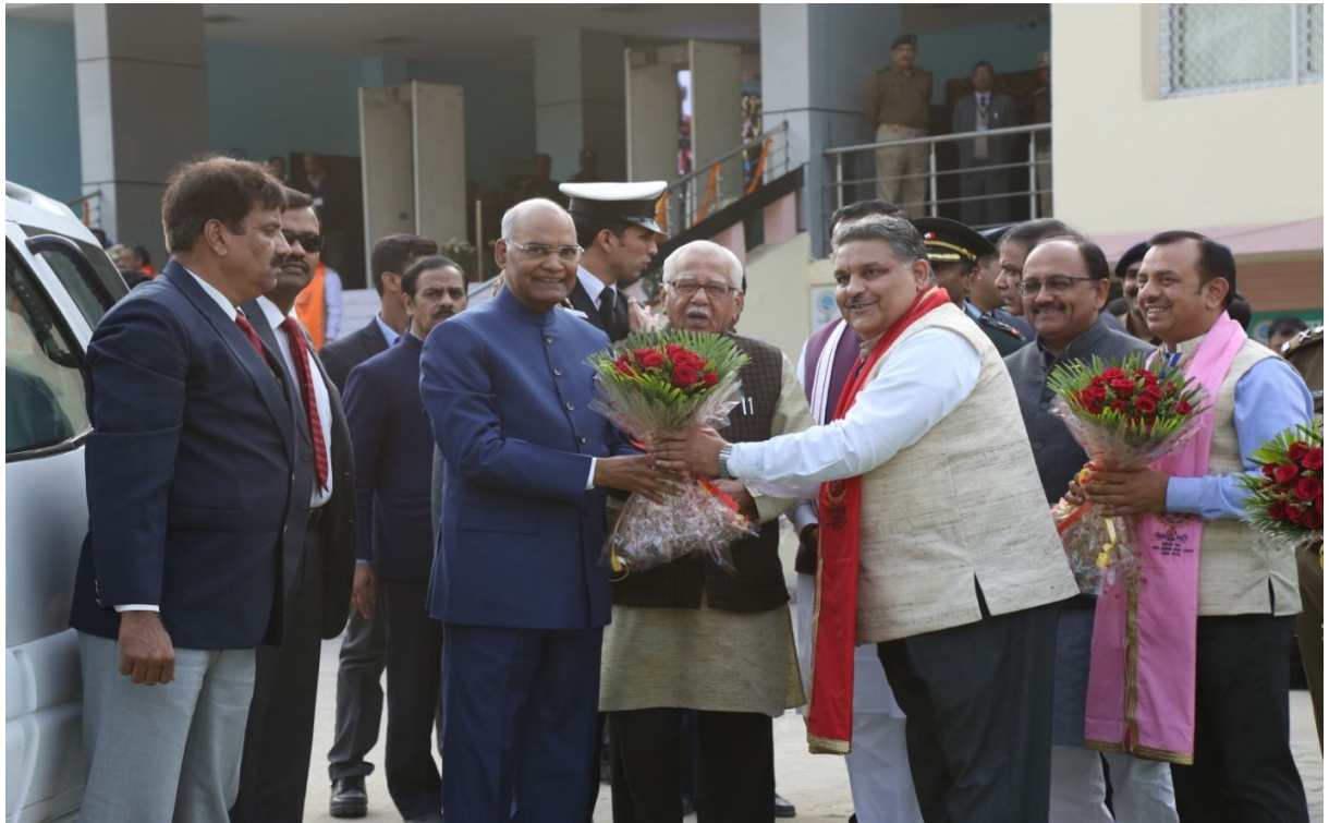
Fourteenth Annual Convocation-2017