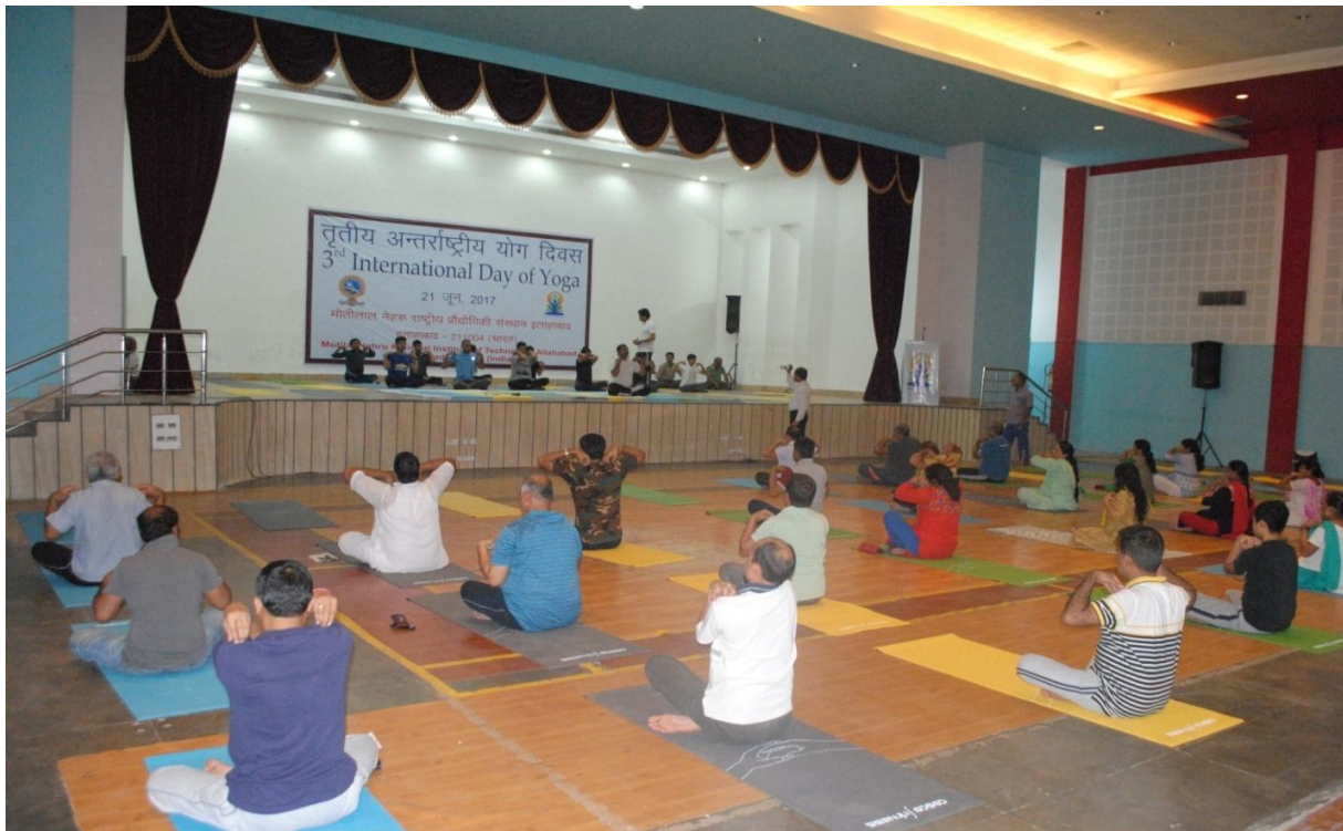
3rd International Day of Yoga