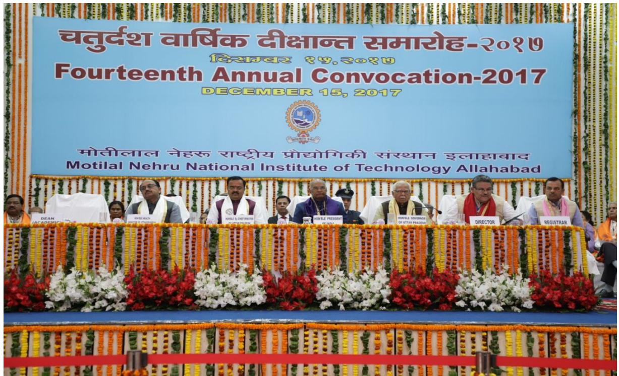
Fourteenth Annual Convocation-2017