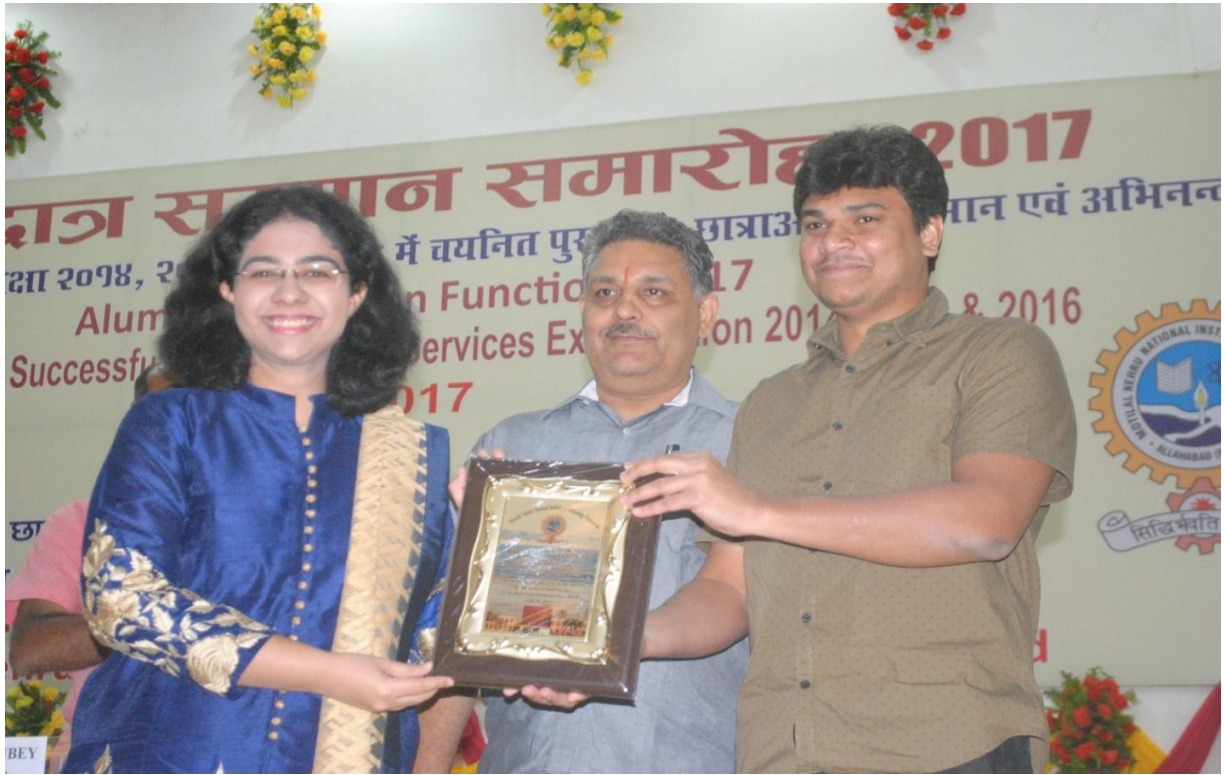
Alumni Felicitation Function