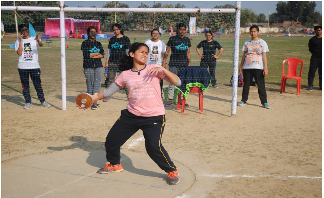
Annual Athletic Meet