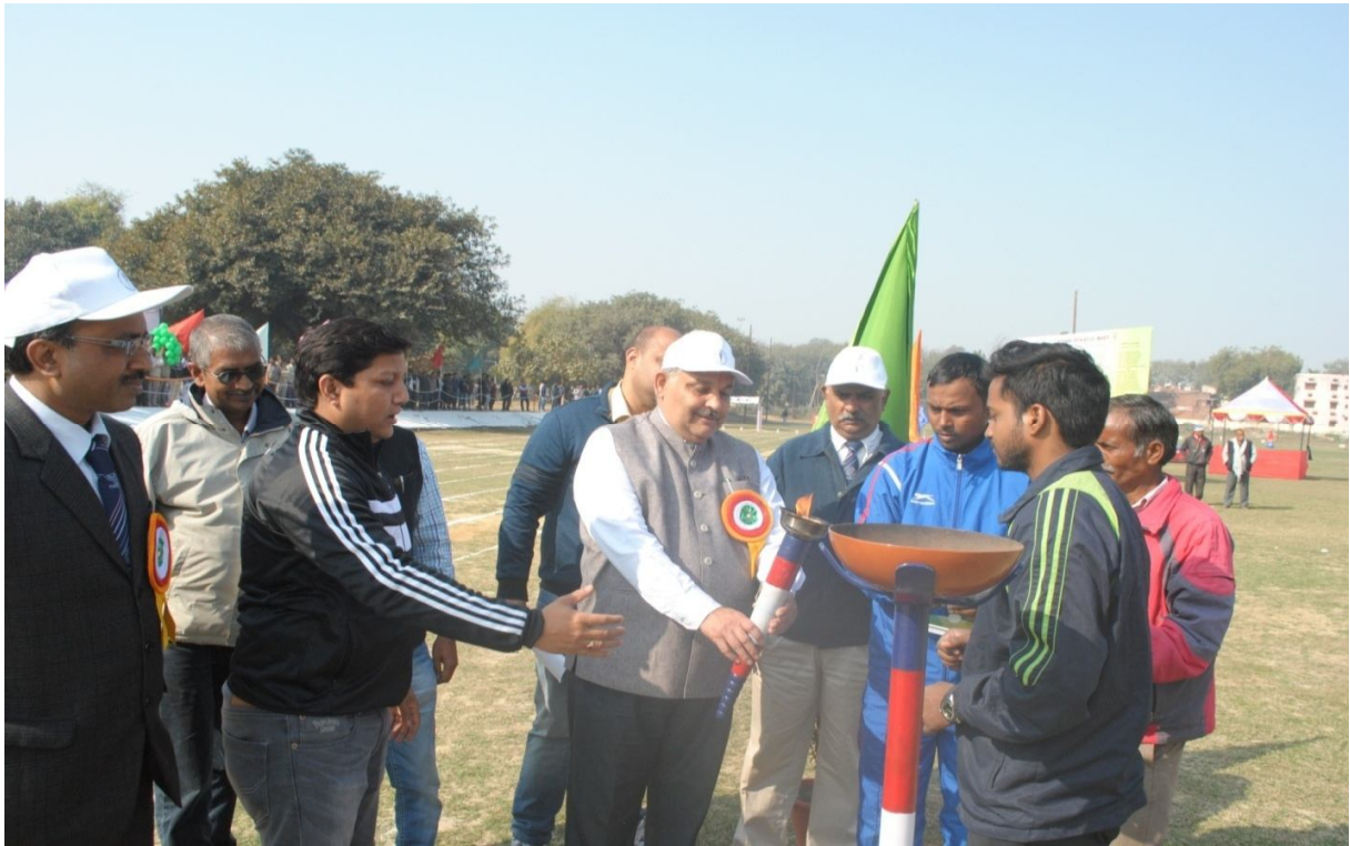
Annual Athletic Meet